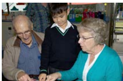
Page 32 Grandparents' Day