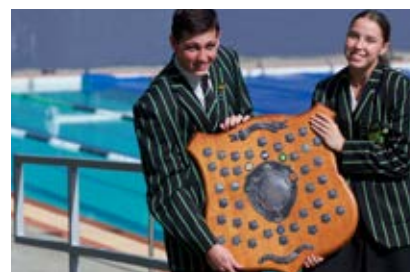
Page 38 Trinity Sport

Page 14 Trinity Alumni: A Word From the President Page 24 10 Year Capital Development Master Plan