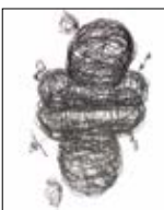
'Tangled' Digital photograph

My work explores the idea that we can be confused about our true nature and struggle to reveal who we are.