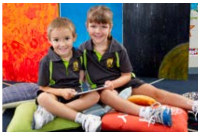
Page 8 NAPLAN 2015 and Beyond