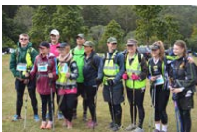
Page 28 Kokoda Challenge Pushes the Limits