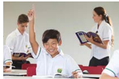
Page 12 Teaching and Learning Excellence at Trinity