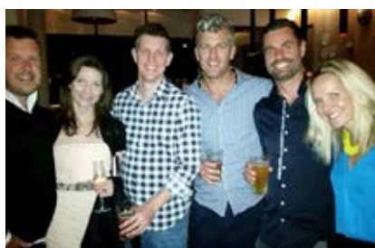
Page 22 "Oh My... Is That?" 1995 20 Year Reunion