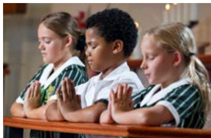
Page 6 Trinity Junior Years' Campus Sponsors Joy