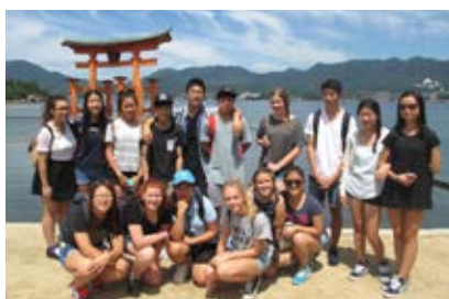
Page 34 Japan Trip