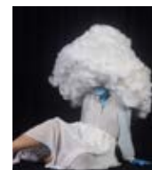
'Disconnected' Digital photograph

My work, Disconnected, embodies the concept of having your 'head in the clouds', through